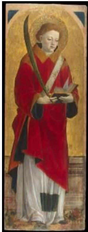
SAINT STEPHEN DEACON & MARTYR