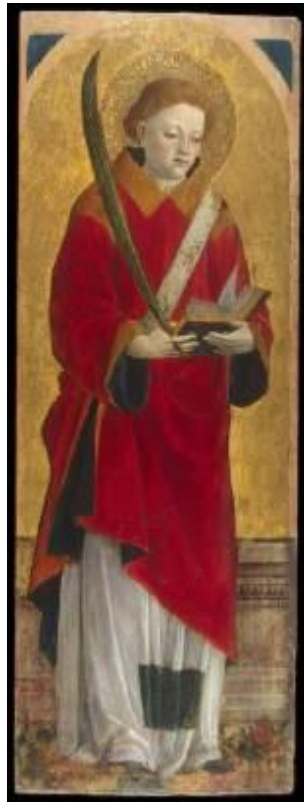
SAINT STEPHEN DEACON & MARTYR