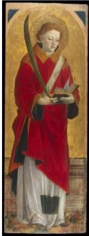
SAINT STEPHEN DEACON & MARTYR